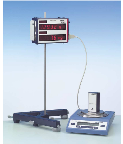
The Cobra3 DISPLAY UNIT can even be used as a demonstrative remote display for scales (Sartorius /Scaltec).

SCALES + DISPLAY-UNIT = Demonstration measuring device