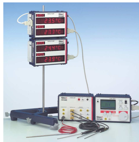
Up to 4 measured values can be shown simultaneously by combining two Cobra3 DISPLAY UNITS.

Temperature pH-Values Potentials Voltages Conductivity