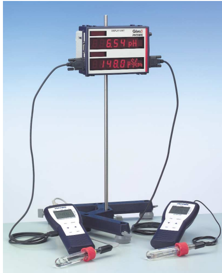
If two hand-held measuring devices are connected, 2 measured values can be simultaneously displayed with their units.