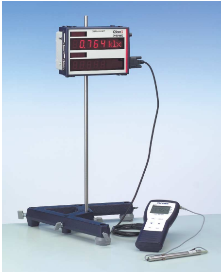
If a hand-held device is connected, its measured values are automatically presented with the corresponding units, clearly visible to the audience.

Hand-held measuring device + DISPLAY-UNIT = Demonstration measuring device